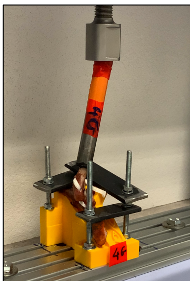
Figure 2: Biomechanical setup for stabilized hip with an UHMWPE implant before compression test.