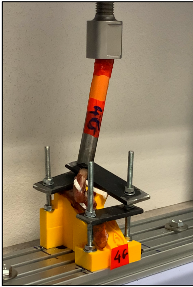
Figure 2: Biomechanical setup for stabilized hip with an UHMWPE implant before compression test.