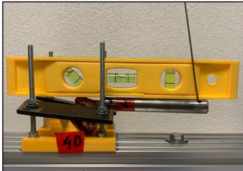
Figure 2: Biomechanical setup to simulate caudoventral hip luxation in a feline cadaver model.

test was set at 100 mm/min in order to induce coxofemoral luxation (Flynn et al. 1994). The traction pull-out test was manually stopped by a veterinary surgeon (E.V.) as soon as caudoventral hip luxation was observed. Given the low angle formed by the metal wire compared to the gravity axis, its impact on the load recorded not taken into account.