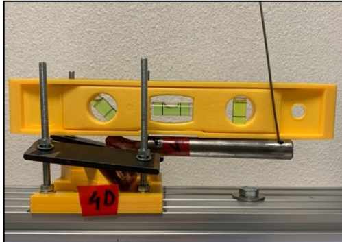
Figure 2: Biomechanical setup to simulate caudoventral hip luxation in a feline cadaver model.

test was set at 100 mm/min in order to induce coxofemoral luxation (Flynn et al. 1994). The traction pull-out test was manually stopped by a veterinary surgeon (E.V.) as soon as caudoventral hip luxation was observed. Given the low angle formed by the metal wire compared to the gravity axis, its impact on the load recorded not taken into account.